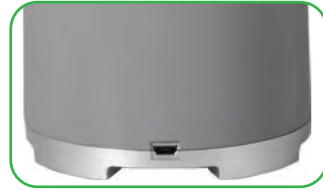
Charging Port on the back of motor base