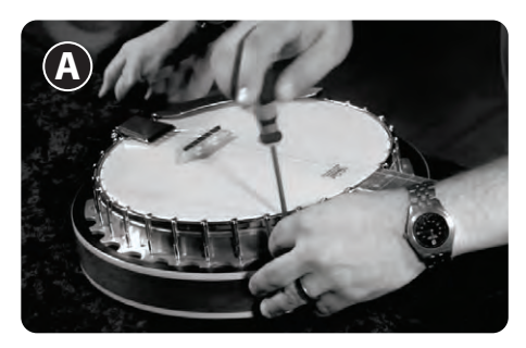
To tighten it up, first take off most of the thumb screws which holds the resonator to the flange so you can access all of the lugs that tightens the head.