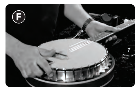
Replace the resonator to the banjo assembly and tighten back all the thumb screws.