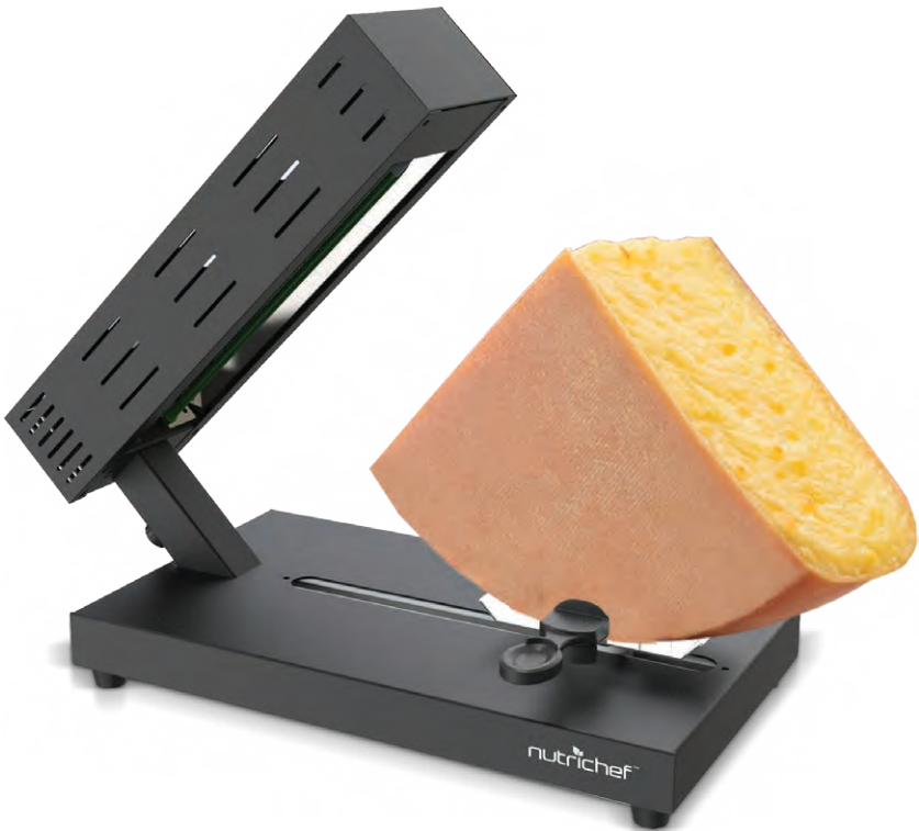
PKCHMT26 Electric Cheese Melter Swiss Style Melted Cheese Raclette Server