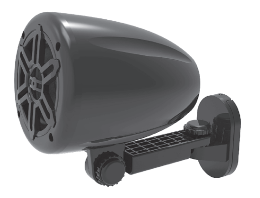
PLMRWK49BK - PLMRWK59BK