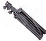
Folding Tripod Base