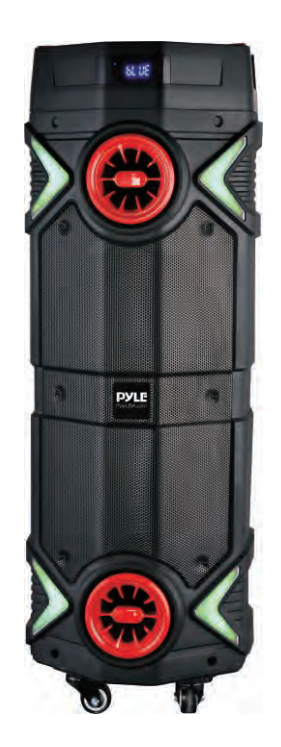
PPHP2694B Dual 6.5"Portable PA Speaker (300 Watt MAX)

PPHP2894B Dual 8"Portable PA Speaker (400 Watt MAX)