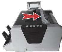
Figure 1 Put the bills by this direction