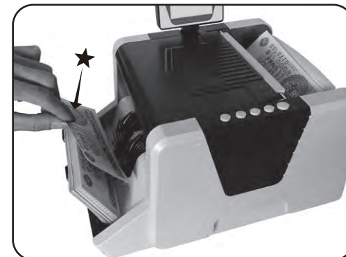
*Fake money or questionable money

When fake money pass the machine, the counting will stop and alarm. The function display will show the error code. The last note on the stacker normally is the fake money. The machine counting quantity number is not included in this note. remove the fake money. Press "RESET" button, the machine will start counting again.