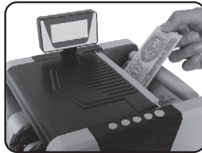
Tensile force test

When adjusting the bill thickness adjustor screw does not solve the problem of improper bill feeding, you may need further help by authorized service center.