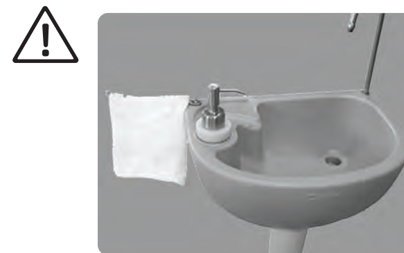
Equipped with multipurpose towel rack

Base tank can be fixed on ground through four holes at the corner if necessary. Pegs are sold separately, not included.