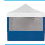
HALF PANORAMA WALL

All accessories or custom graphics can be ordered on line visit us at www.SerenLifeHome.com