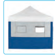
FOOD BOOTH SIDEWALL