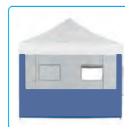
FOOD BOOTH SIDEWALL