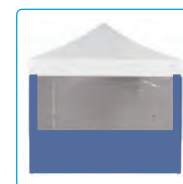
HALF PANORAMA WALL

All accessories or custom graphics can be ordered online visit us at www.SerenelifeHome.com