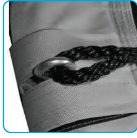
14. Tope looking and appearance