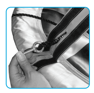
9. Screw bolt go through the velcro belt cover.