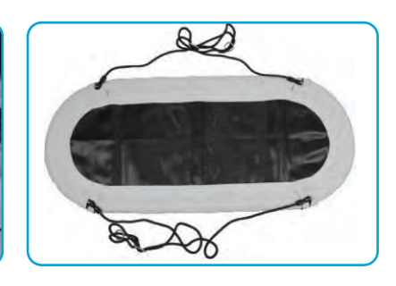
15. Combine assembled jump body. You have finished the Oval Swing assembly.