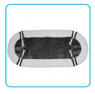
7. Then connect the body as a oval platform.