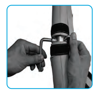
12. Use wrench tight it before use.