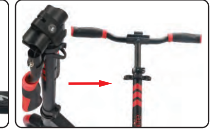
Assemble the handle bars