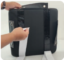
1. Tear off the upper adhesive