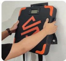
2. Secure the Boxing mat in place