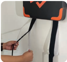
3. Tear off the bottom adhesive