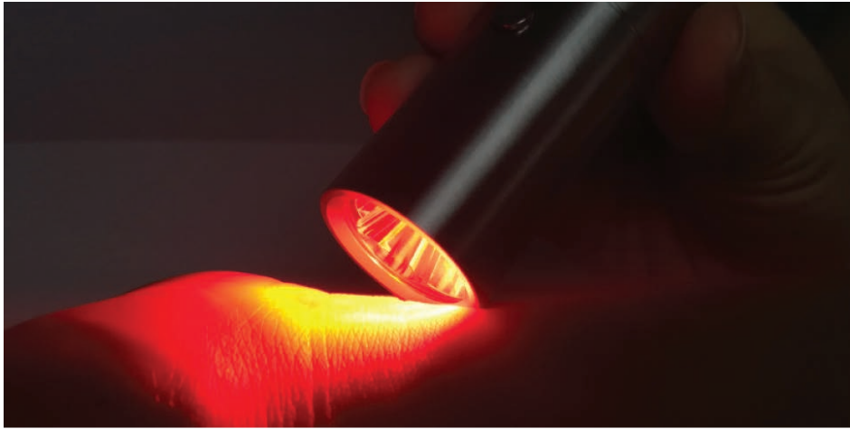
For wrist treatment