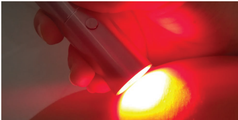
For knee treatment