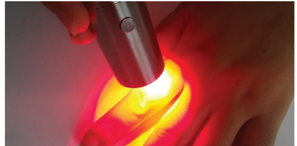
For finger treatment